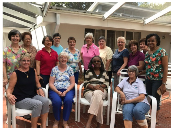
Members of the Associate Advisory Committee and Local Area Coordinators during the October 2016 meeting in Tampa.