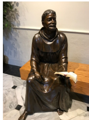
Statue of St. Francis in the foyer of the Aston Franciscan Motherhouse.

Since one of the thrusts of the conference was to enhance interaction between communities, an opportunity was given to share part of the day with associates and sisters from other congregations.