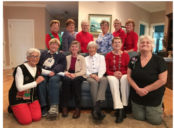
North Carolina Christmas celebration