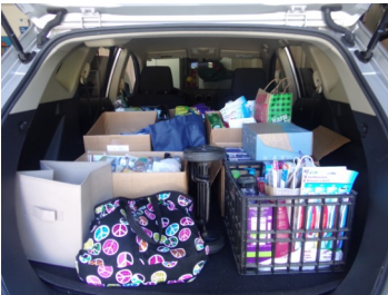
One of three carloads of toiletries

With exceptional assistance from the sisters of St. Anthony Convent (St. Petersburg) and St. Elizabeth Convent (Tampa), as well as financial support from sisters in Miami, the Associates of Tampa Bay were able to collect fifteen (15) boxes of items for the children of St. Peter Claver School. Toothpaste, tooth brushes, soap, shampoo, deodorant, lotions, hand sanitizers ~ a virtual pantry of toiletries ~ were delivered just before Christmas. Even a closet was included!