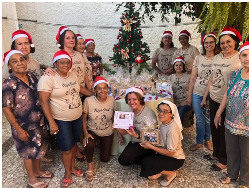
Christmas Festivities - Pires do Rio, Brazil