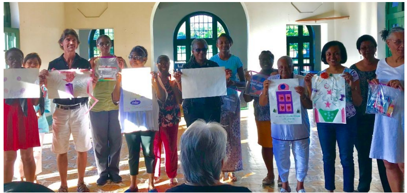
Retreat Day in Jamaica