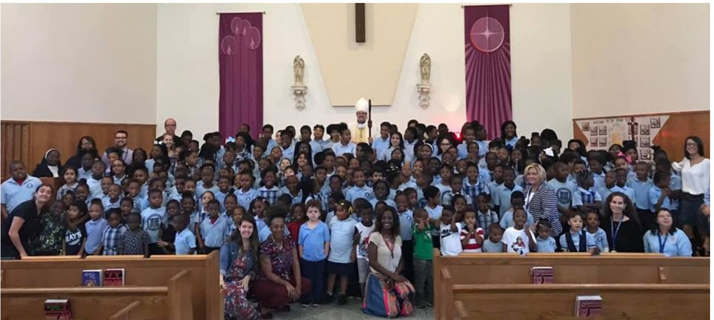
Students, faculty and staff of St. Peter Claver School