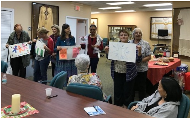
Retreat Day in Miami, FL