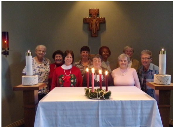
Pearl Anniversary Celebration - Tampa, FL