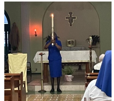
The Paschal Candle during the Transitus