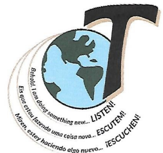
Gwen Melhado OSF