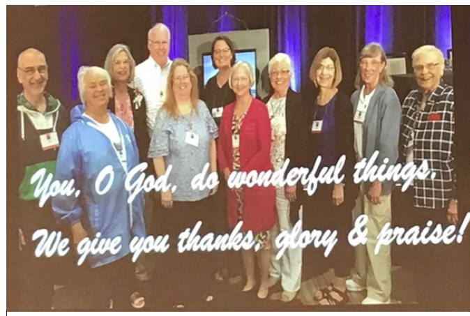
Associates at the Franciscan Federation Conference

Since the number of Associates is now exceeding the number of vowed religious in many congregations