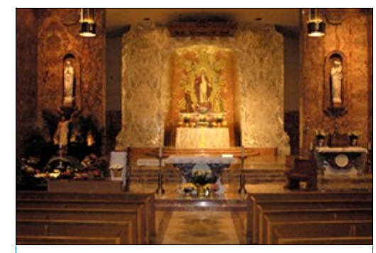
The Chapel of St. Elizabeth Motherhouse

I came home with a renewed sense of the commitment of the Alleganies to reflect God's kindness and love, which is their charism... and ours, as Associates, as well.