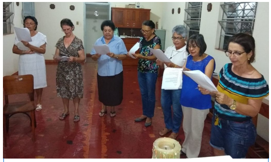
Associates in Cristalândia renew their Commitment to the program.

It was the Associates' Commitment Renewal Day in Cristalândia -TO. With 18 Associates currently active in the community, 14 were able to attend and participate. The four missing will make their recommitments at a later date.