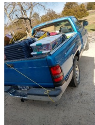
Truck loaded up for moving day!