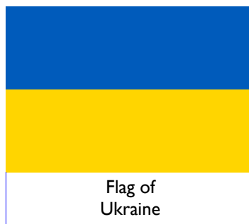
Flag of Ukraine