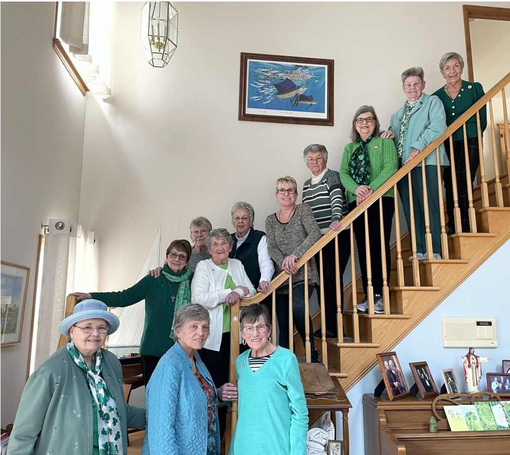
New Jersey Associates celebrate Saint Patrick's Day