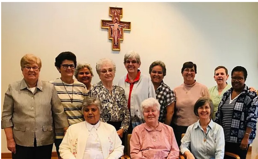
The Chapter Planning Committee

It has stayed busy especially after reviewing all of the responses from the Assemblies - from sisters and associates. As a result, the CPC feels that because of the Gospel as lived through our Franciscan-Clarian spirituality, our mission, vision and charism, we are impelled to address the following Chapter Focus Areas: