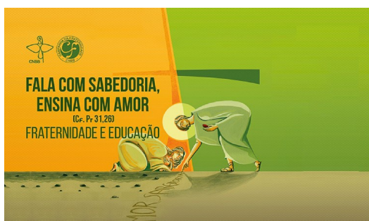
Caption on the left says “Speak with wisdom, teach with love.” Fraternit as and Education

For the members of the Associates’ community , it is very important to participate in this campaign every year and to reflect on themes impacting the people of Brazil. There is a recognition that education suffered greatly during the years of pandemic, so it is only right that that Church reflect on this very relevant topic.